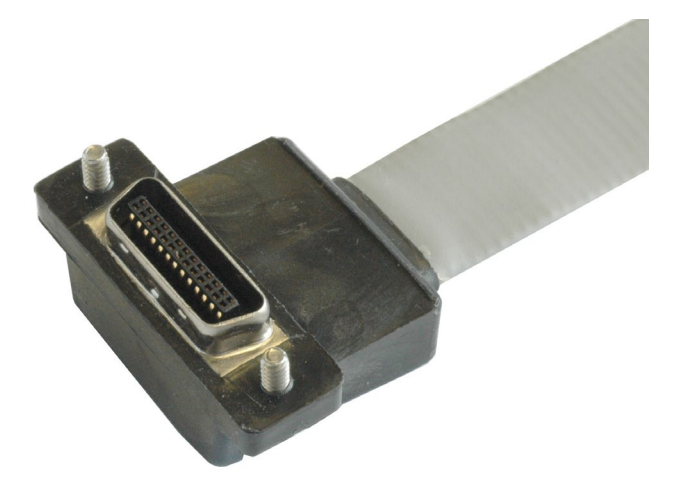
Detail of AS-CBL-CL-ADPU-B-M2

Adapter cable AS-CBL-CL-ADPx-A-M2 can be used to provide a standard Camera Link socket on the system case if the PC/104 stack does not allow the Phoenix-Dig24CL connector to line up with the case. This comprises a low profile right angle plug that plugs into Phoenix-Dig24CL , 0.2m of special ribbon cable, and a panel mount Camera Link socket. The 'x' in the part number can be 'U' or 'D'. 'U' means that the ribbon cable exits upwards from Phoenix-Dig24CL , 'D' exits downwards.